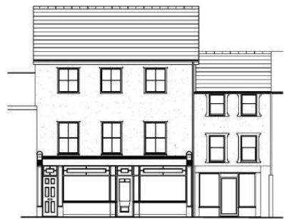
FRONT ELEVATION North West