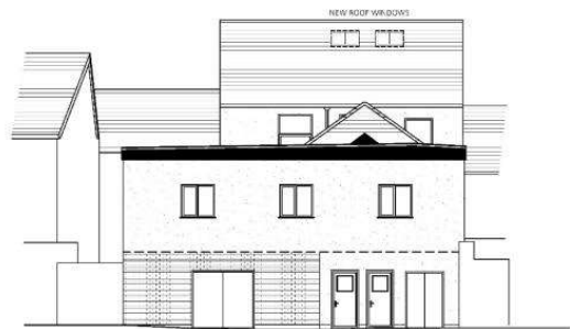
REAR ELEVATION South East