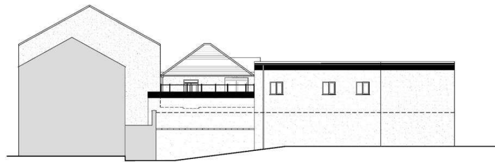
SIDE ELEVATION South West