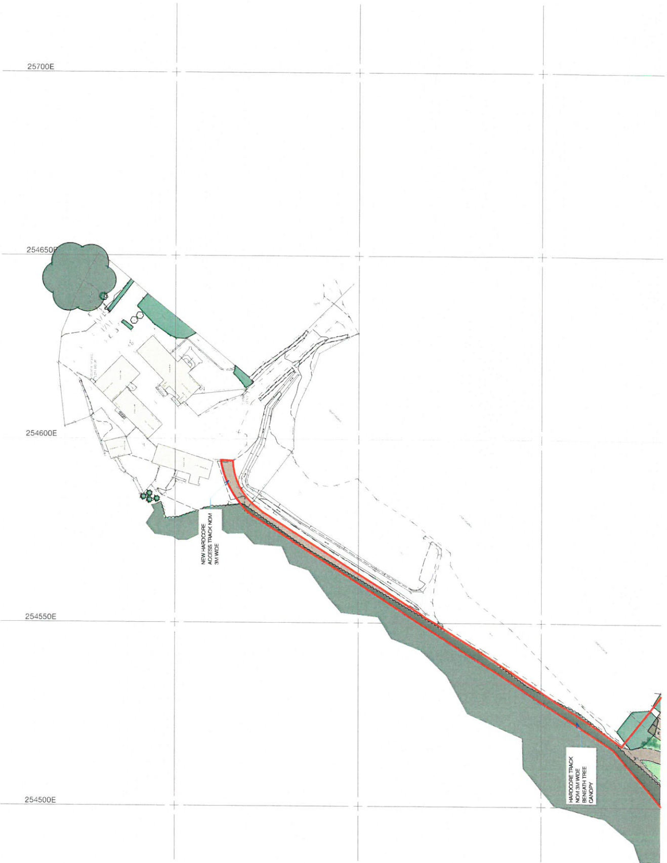
Site Layout 1:500

Copyright 2017 All rights reserved. This drawing is the property of WMS Design and Architecture Ltd. It is to be used for the project only and is not to be reproduced or used in any other project without the written consent of WMS Design and Architecture Ltd. All dimensions are in millimetres unless otherwise stated. All work is to be completed in accordance with the current Building Regulations and all relevant standards.